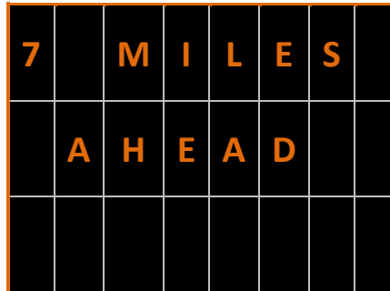
Panel 2 (2-Second display)