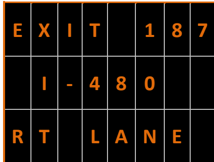
Panel 1 (2-Second display)

Message Board Located at MP 198.50 (6.8 miles prior to split). The Message Board displays the 2-panel message shown below: